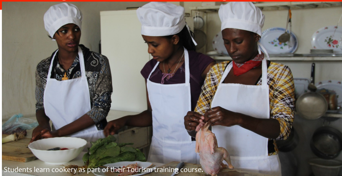
Students learn cookery as part of their Tourism training course.

Vocational and higher education training has long been an important part of Kindu Trust's sponsorship model. The sponsorship programme aims to support disadvantaged children reach their full potential in education. For some children or young adults, rather than university, this can mean learning a skill or taking university extension classes.