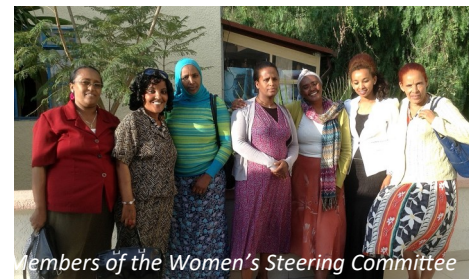
Members of the Women's Steering Committee