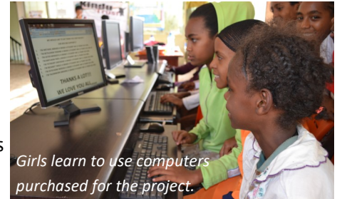
Girls learn to use computers purchased for the project.

Following feedback from the project, we wanted to further our understanding of the obstacles that girls face in secondary education and solutions to help overcome these. In 2015, working with our partner charity, Link Ethiopia, we established a Women's Steering Committee to discuss these issues, share their experience and propose solutions. The Committee was selected to involve Ethiopian women working in various aspects of girls' education, support and women's empowerment. It includes our Sponsorship Manager, Link Ethiopia's Regional Manager, Director of a local Women's Cooperative, the Women's Officer and a student from Gondar University, and more. The women met on a regular basis over 6 months to discuss these issues and will devise a number of pilot projects which we will trial to support girls in secondary education.