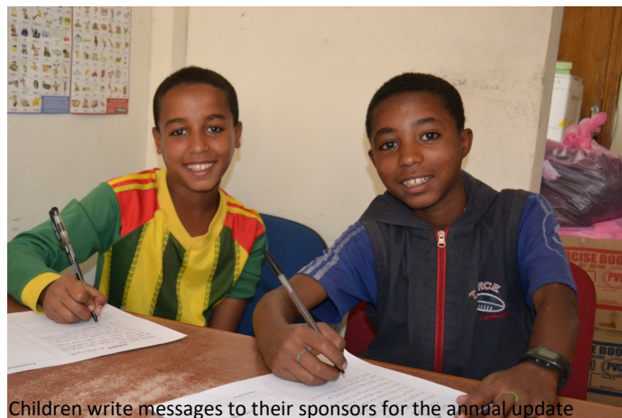
Children write messages to their sponsors for the annual update

Project Management covers the costs of regular home welfare visits, ongoing in-country support for the sponsored families and annual updates to sponsors.