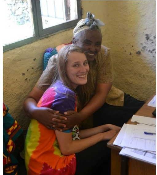
Above: A volunteer teaches English at the Kindu Klub. Below: A volunteer works with our affectionate Sponsorship Manager!

The Kindu Trust volunteer scheme provides the opportunity for people to venture out to Ethiopia and immerse themselves in a different cultural experience with a wonderful and welcoming team while contributing to an excellent cause: our work with disadvantaged children!